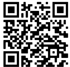
QR code to donation portal